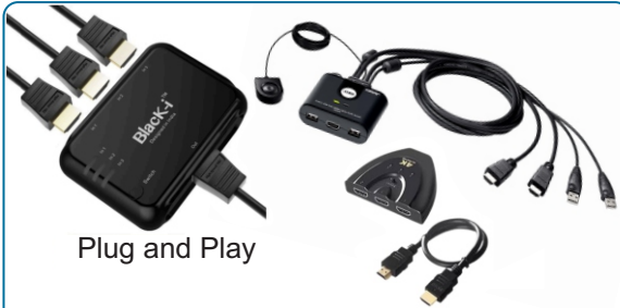
Plug and Play